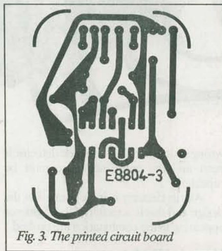
Fig. 3. The printed circuit board

The alarm in the circuit shown is not going to wake the street; in its present configuration it is more of a loud indication that the incorrect sequence has been entered. It would not be difficult to fit a second relay into the alarm section of the circuit which could trigger a bell alarm, or a flashing neon arrow with "Burglar" written on it, or even to release an enormous weight from the second floor onto the burglar... ■