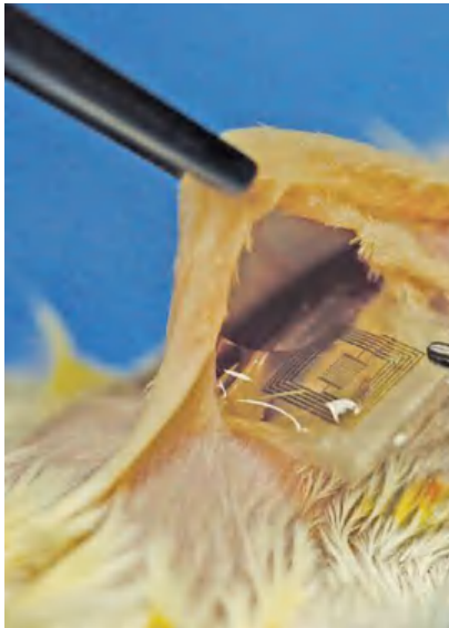
This electronic implant can dissolve inside the body

Medical implants that are only needed for a few weeks could just