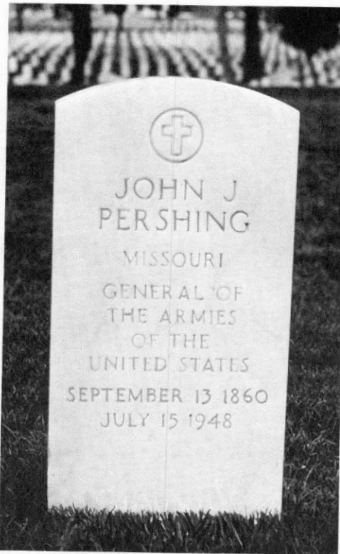
Grave of General of The Armies John J. Pershing (Lot S-19, Section 34). The grave of the famed commander of the American Armies during World War I is marked by a regulation white marble government headstone. Many years before his death General Pershing personally selected this location, stating that he desired that his remains might be at rest near his brave comrades who served with him during the World War (1917–1918).