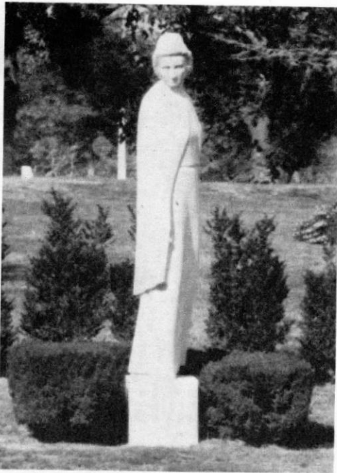
Army and Navy Nurses Memorial —This monument erected in the Nurses Section (Section 21) at Arlington National Cemetery is a memorial to deceased Army and Navy Nurses. It was dedicated on 8 November 1938.