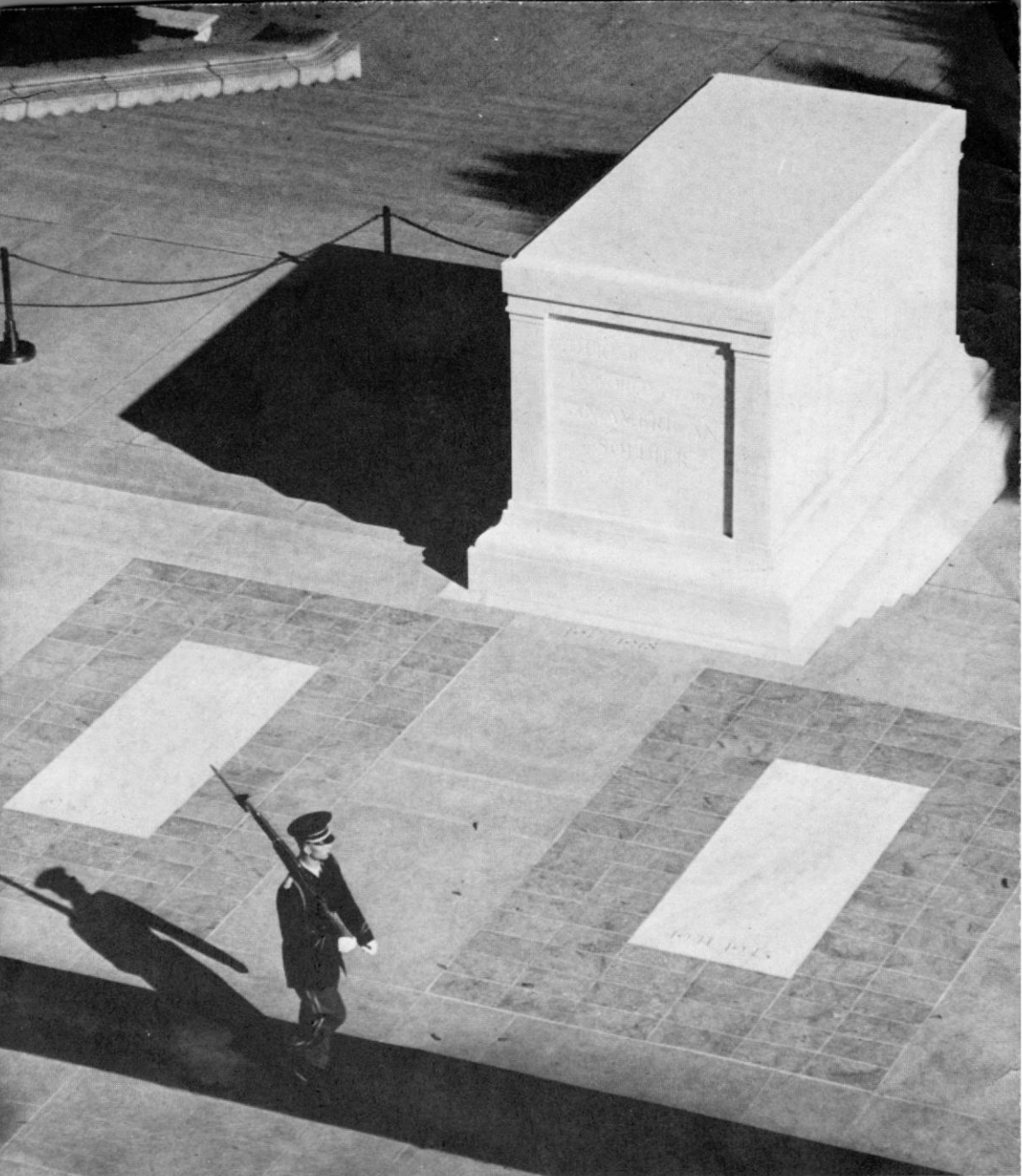
KNOWN BUT TO GOD —Tombs of the Unknown Soldier of World War I, the Unknown American Serviceman of World War II and the Unknown American Serviceman of the Korean War. Located in the plaza of the Arlington Memorial Amphitheater, this hallowed place of remembrance is guarded twenty-four hours a day by specially chosen members of the 1st Battalion (Reinforced) 3d Infantry (The Old Guard) U. S. Army of Fort Myer.