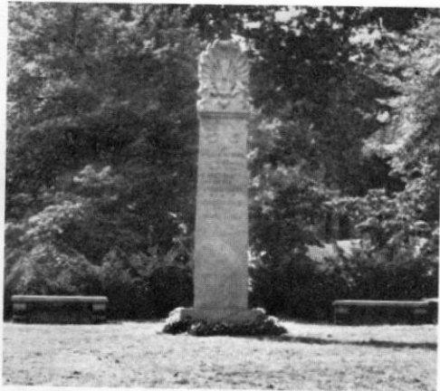
Grave of William Howard Taft —27th President of the United States (1909–1913), Chief Justice of the United States (1921–1930), Lot S-14, Section 30.