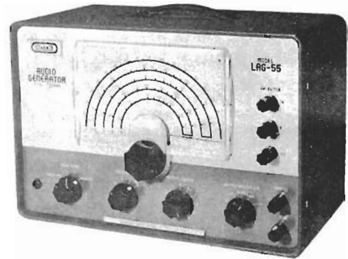
STARKIT MODEL LAG-55

A very constant output level is maintained due to the use of a thermister in the negative feedback circuit.